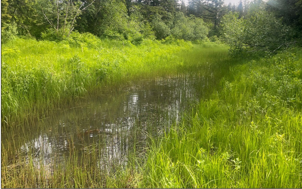
Figure 2.—Upstream at waypoint 311.