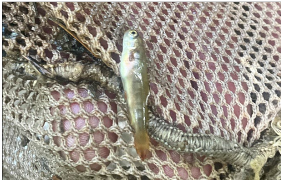
Figure 1.–Juvenile coho salmon caught at waypoint 312.