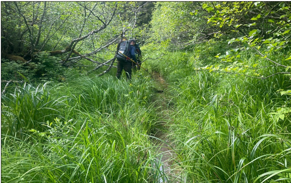
Figure 3.—Downstream at waypoint 312.